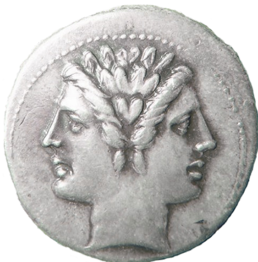
Exhibit 1 – Janus the Roman God of Looking in Two Directions at Once 1

Designing and implementing effective automation requires an understanding of some surprisingly straightforward concepts. These concepts already exist in the heads of traders, middle office and operations but do not usually have techy sounding labels attached to them, for example algorithms, data, variability and